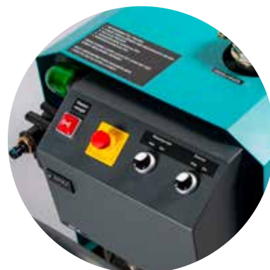
Automatic temperature control