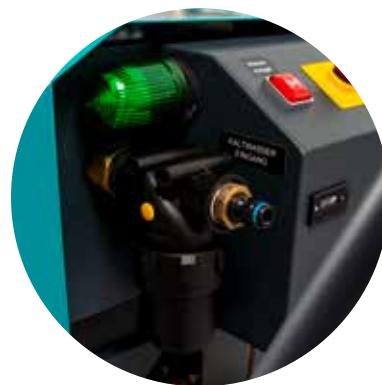
GARDENA®-compatible cold-water connector with water filter