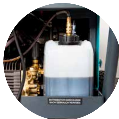
Bracket for foam, cleaner or lime-free container